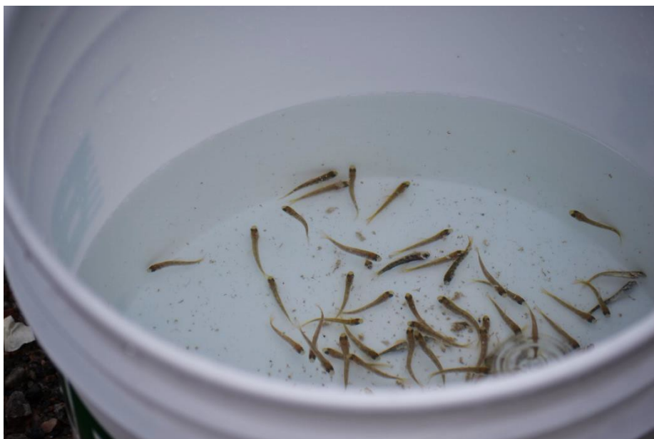
Bucket with fry inside during a stocking activity.

Thank you to all the students, teachers, and volunteers for participating in this great collective project.